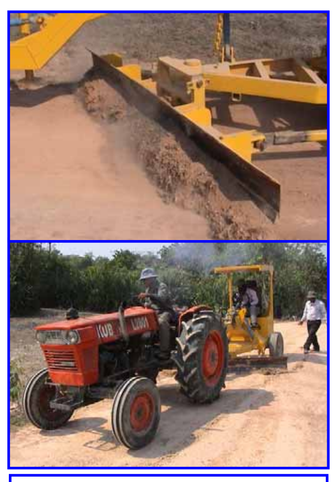
Figure 2 - ENGINEERED NATURAL SURFACES: Maintainable using simple locally made equipment & basic agricultural tractors

Poor people often rely on nonmotorised transport, motorcycles and simple trucks for their transport needs. On many soils, an engineered earth road is sufficient to provide reliable basic access for these vehicle types, provided that specific, limited location constraints, such as watercourse