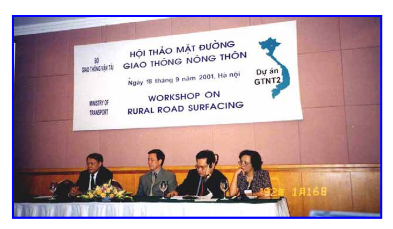
Figure 6 – Initial Rural Road Surfacing Workshop chaired by Vice Minister, October 2001

An important part of the process of bringing about desirable sector changes to allow the use of appropriate rural road surface options and SMEs, is to develop an effective steering framework to plan and manage the introduction of new techniques, procedures and operational framework, with appropriate awareness creation, stakeholder consultation and knowledge dissemination.