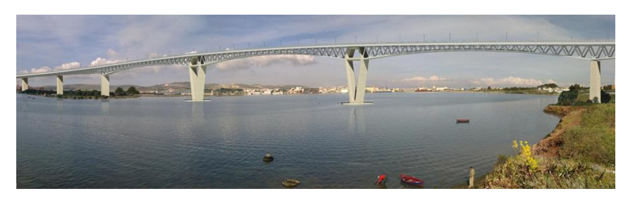
Tunis - Jelma Highway